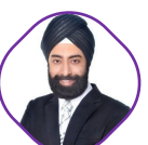
Ash Singh Hyper Accelerator